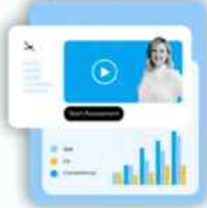
Talent Assess: Deep Tech and Non-Tech Skills Assessment