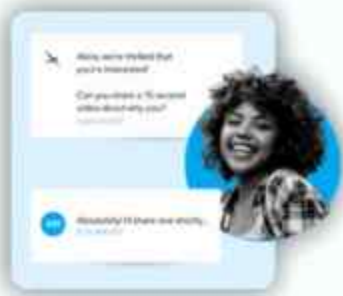
Talent Connect: Outreach and engage top talent