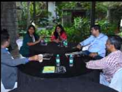
PHARMA, HEALTHCARE & LIFESCIENCES

This segment was a one-of-a-kind interaction among TA Leaders from different industries.