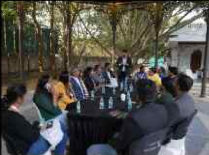
IT PRODUCTS & SOFTWARES I