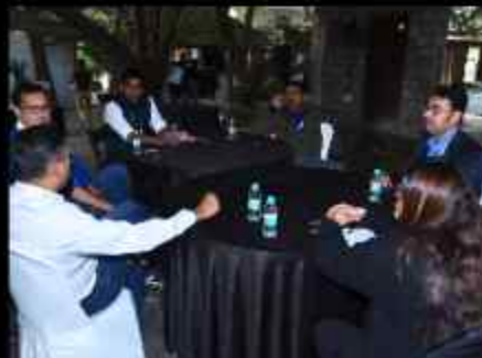
MANUFACTURING & ENGINEERING