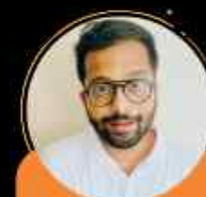
Swaroop Kanaparth Ezetap Mobile Solutions Pvt Ltd