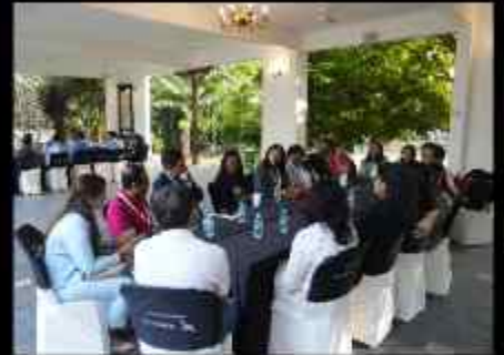
IT PRODUCTS & SOFTWARES II