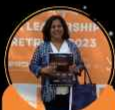
Jagadamba B Diageo