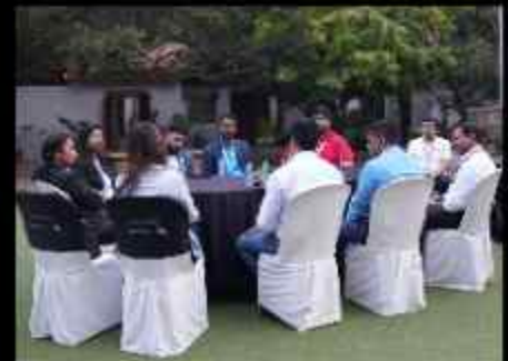
IT SERVICES & CONSULTING II