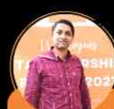
Utpal Kirodian Upstox