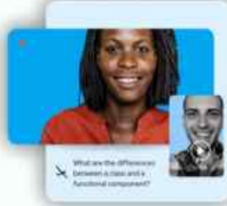
Talent Interview: Live or One-Way Video