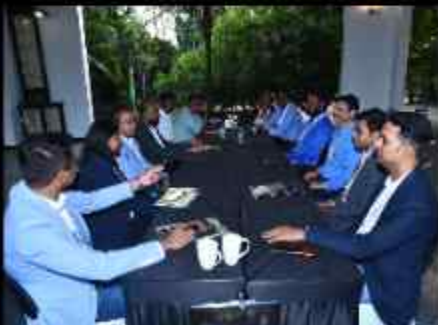
IT SERVICES & CONSULTING I