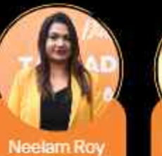
Neelam Roy Zyous Infotech