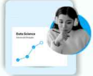
Talent Learn: Keep your best people engaged and trained!